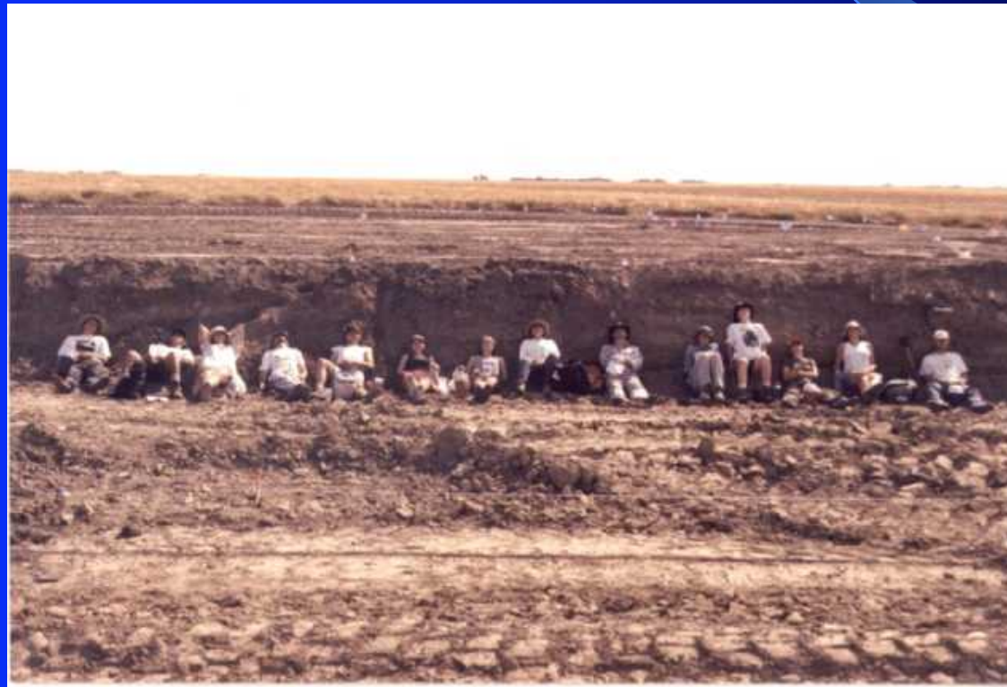
The Excavation Crew