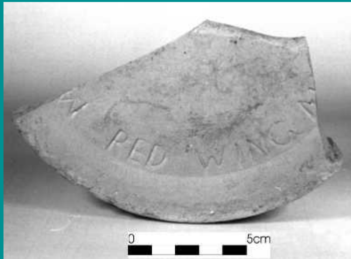
Kozakavich 1998: 124