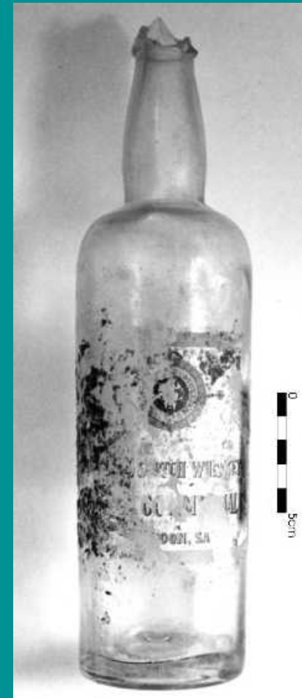
Kozakavich 1998: 144