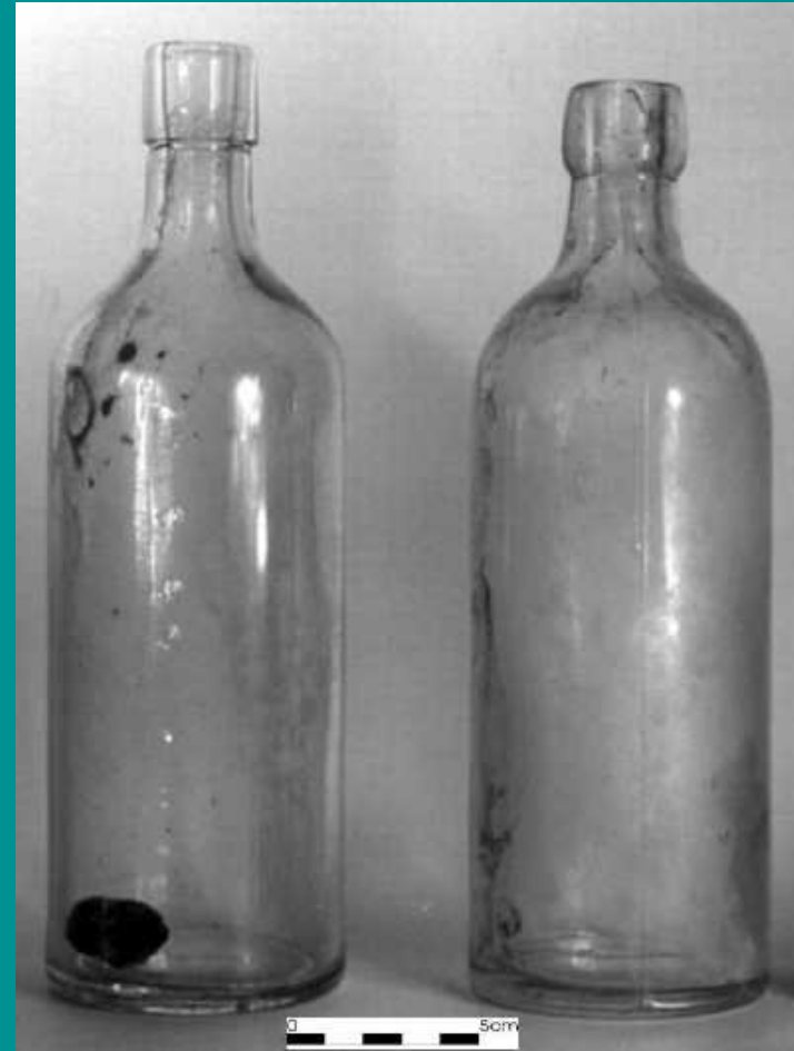
Kozakavich 1998: 150